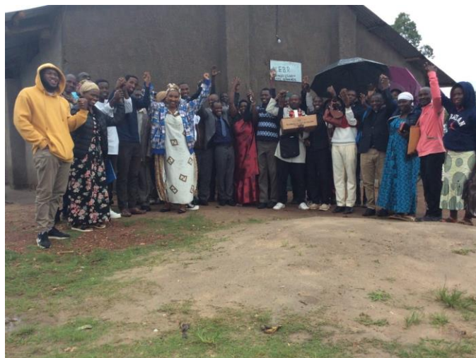
Bible distribution day