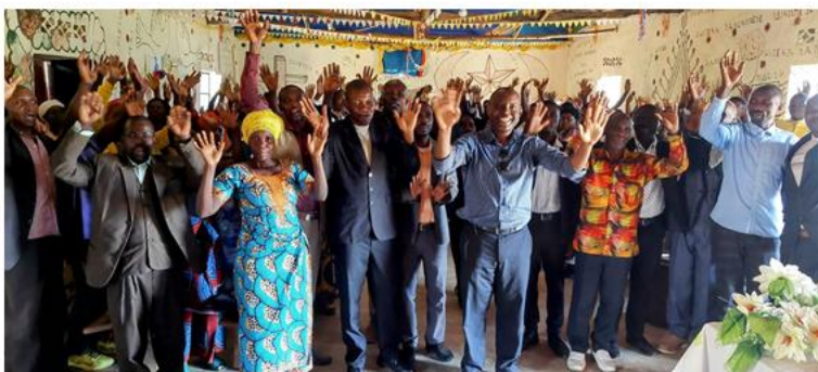
Discipleship Group in Busasamana (Western Province, Rwanda)