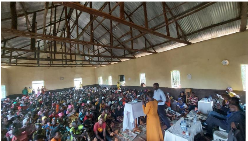
Discipleship groups in Sacye (Eastern Province, Rwanda)