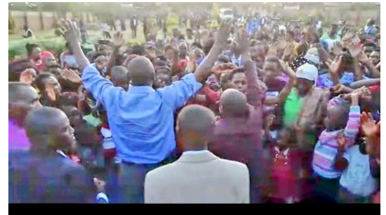
2-day Crusade in Mateete, Uganda