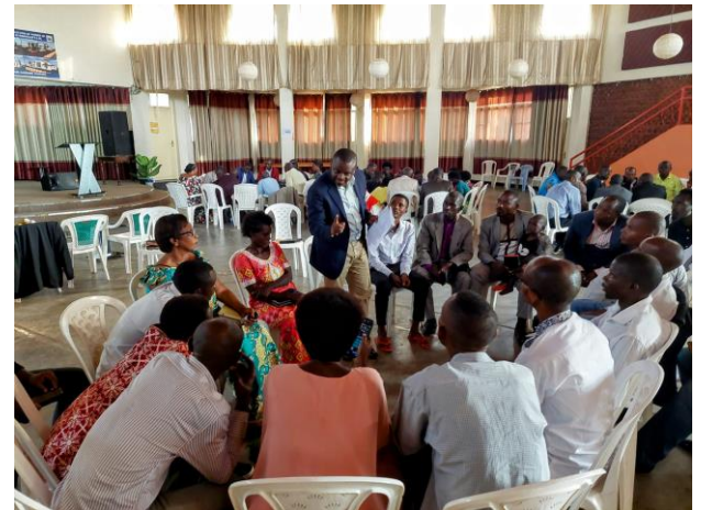
Raising Leaders Conference in Kigali, Rwanda